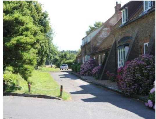
The cottages at the end of Low Road

From the hotel walk down the drive to the main entrance. Cross the road to the footpath on the opposite side of the road and turn left. [1] Proceed to the junction with Low Road (about 100yards/91metres) and carefully cross the road onto the footpath in Low Road. Proceed along this footpath until the end of Low Road where you will see a row of cottages on the right. Walk along the front of the cottages until you reach the road. Cross the road to the public footpath opposite and proceed along it until you come to a wood. [2]