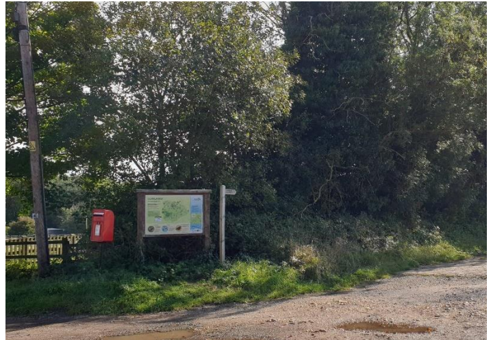
The post box and noticeboard

Just after passing Congham Farms Ltd., turn right onto St Andrews Lane and follow this road through Congham [3] until you see a post box and a noticeboard on your left.