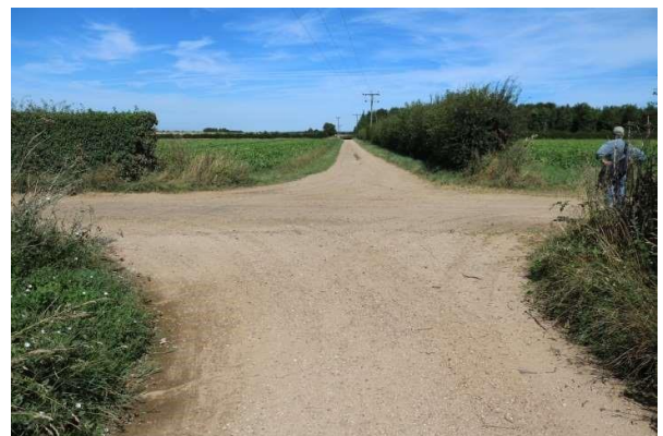
This is the first track you will cross

Parts of this track can be quite muddy at times even in summer. In summer as you walk along this track you may see lots of Butterflies and Dragonflies. Continue along this track which will take you out of the wood, the track now has hedges on both sides. About 400 yards/366 metres after leaving the wood you will pass a small pumping station on your left. Continue along the track crossing one track and after 400 yards/366 metres you will reach another significant track where two power lines cross. Turn left and follow this track along the edge of fields until you reach a road. (0.7 miles/1.2kilometres)