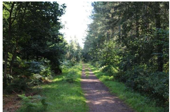
The track through the woods

Continue through the wood past a large house with fenced in grounds on your left until you reach a sign for 'Congham Heath Wood'. There is a notice board here showing other walk's within the wood. However continue along the track, with Scots Pine with its reddish bark on your left and the taller more robust Corsican pine on your right, until you reach another track crossing at right angles to the one you are on. (0.93 miles/1.73 kilometres) Turn left onto this track.