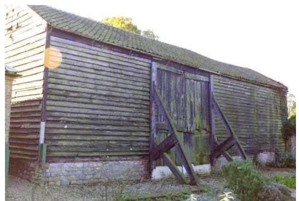
The large doors on the back of the barn

[4] The land that you are walking across was once part of the Congham Hall estate. Corn grown on it would be taken back to the threshing barn, which is now part of the Congham Hall Hotel complex. The side of the barn which faces the herb garden had large doors to allow the loaded wagons in to be unloaded. The other side which faces the courtyard had a small doorway as it only had to allow empty wagon's to pass through.