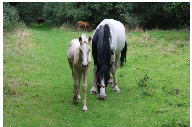
Horses feeding on the old railway track

If you have walked from the hotel then cross Chapel Road and walk across the green in front of you until you reach Lynn Road. Continue walking along the road until you see Low Road branching off Lynn Road opposite. Carefully cross the road and continue to your right along a grass footpath along the edge of the green. You then continue along a footpath past 'The Three Horseshoes' public house across Broadgate Lane and continue until the footpath ends. Then cross the road to the footpath on the opposite side of the road until you are opposite the entrance to Congham Hall. Cross the road walk down the drive back to the hotel.