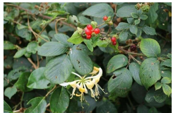
Honeysuckle flower and berries

You will hear lots of bird song whilst walking this track. In late summer and autumn look out for the Honeysuckle and the bracket fungi growing on the Birch trees.