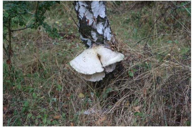
Bracket fungi growing on a birch tree

Continue along this track for almost 1 mile/1.6 kilometres. You will come to a gate, go through the gate and you will be on a wider grassy track. This is the old railway track. [1] Take a U-turn to your right, following the old railway track for just over \frac{1}{2} mile/0.8 kilometres. You will cross over a stile along the way. And you may come across horses feeding along the track. You will see a track going off to your left and a wide gate on your right. Continue in the same direction you were walking, past the gate, and you will shortly come to another, smaller gate on your right. Go through the gate, walk a few paces through the gorse and follow the path round to the left, and continue walking past the gorse and through the trees for \frac{1}{3} mile/ 0.5 kilometres. The path ends at Pott Row playing fields. If you have driven to the playing fields you will see your vehicle just to your right.