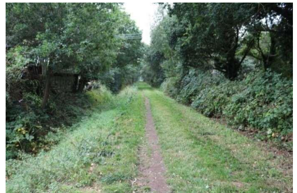
The track you will follow from the playing field

Walk down the drive from the hotel and carefully cross the road to the footpath on the opposite side of the road. Turn right and walk along the footpath until it ends then cross back over the road to the footpath on the Congham Hall side of the road. Turn left and continue along the footpath until you are opposite Chequers Road on your left. Cross Lynn Road again and walk down Chequers Road until you come to a junction with Chapel Road.